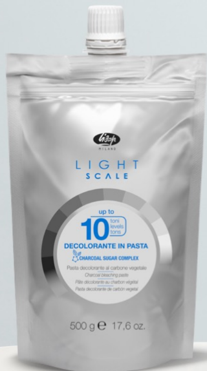
500 g Sachet

THE NEW CHARCOAL BLEACH PASTE WITH LIGHTENING POWER UP TO 10 LEVELS CREATING THE PERFECT BLONDE LEAVING HAIR HEALTHY AND HYDRATED